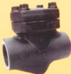
TSL Forged Lift Check

ANSI: 800, NACE Size: 3/8" through 2" A105*CR13 SS*RP