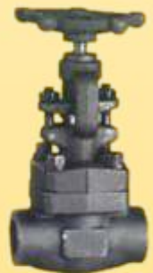
TSB Forged Globe

ANSI: 800, NACE Size: 1/2" through 2 1/2" A105*CR13 SS*RP