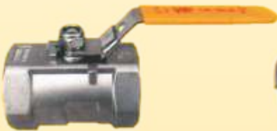
TBES 1PC THD Ball Valve

WP: Up to 2000, NACE Size: 1" through 4" DI *13CR SS* RP/FP