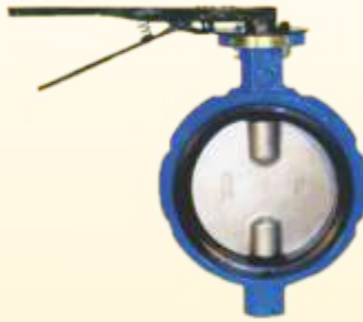
TWW Wafer W/Short Neck

WP: 200, long neck Size: 2" through 12" DI *NPDI* Buna