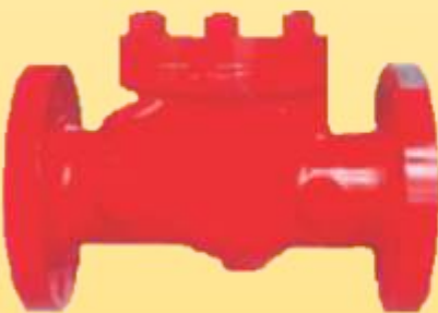
TFKA Flange Check Valve

ANSI: 150, 300, 600, NACE Size: 4" through 12" WCB *SS*FP*W/Gear