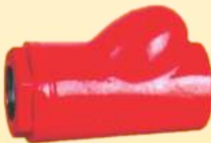
TKBC THD Ball - Check

WP: Up to 2000 Size: 1" 2", NACE DI *CF8M* Viton