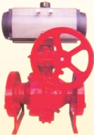
TFBTA Trunnion W/Actuator

ANSI: 150, 300, 600, NACE Size: 2" through 6" WCB *SS*FP*W/Actuator