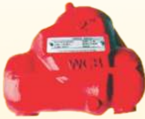
TKAC THD Swing Check

WP: Up to 2000, NACE Size: 1" through 4" DI *CF8* Viton*FP