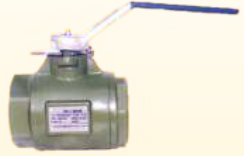
TBAD THD Ball Valve

WP: 1000, NACE Size: 2", 3" 4" DI *SS316*RP