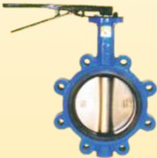
TWL Lug W/Long Neck

WP: 200, Notched Size: 2" through 12" DI *NPDI/CF8M* Viton