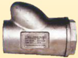
TKBS THD Ball - Check

WP: Up to 5000 Size: 1" 2", NACE DI *CF8M* Viton