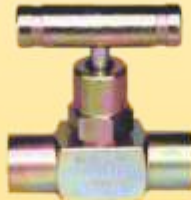
TNMCH/MSH Mini Valve

WP: 6000 Size: 1/4"M*F Material: CS/316SS, Round HDL