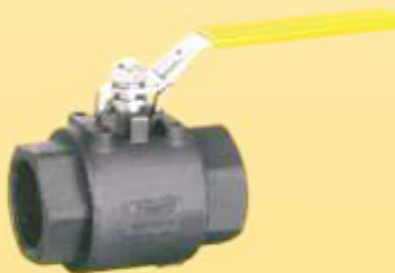
TBCC 2PC THD Ball Valve

WP: Up to 2000, NACE Size: 1/4" through 2" WCB*CF8*FP locking HDL