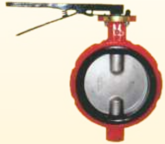
TWW Wafer W/Short Neck

WP: 200, Notched Size: 2" through 12" DI *NPDI/CF8M* Buna