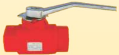
TBAC 8 RoundBall Valve

WP: 2000, NACE Size: 1/4" through 2" CF8M*316SS*FP