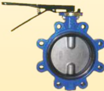
TWL Lug W/Short Neck

WP: 200 Size: 2" through 12" DI *NPDI* Buna