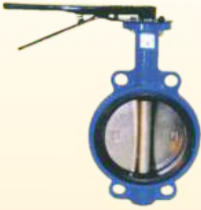
TWA Wafer Alignment

WP: 200, long neck Size: 2" through 12" DI *NPDI* Buna