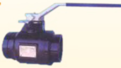
TBGD Groove Ball Valve

WP: Up to 5000, NACE Size: 1" through 4" WCB*SS*Derlin*FP/RP