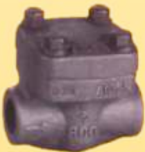
TSS Forged Swing Check

WP: Up to 5000 Size: 1" 2" CF8M*CF8M* Viton