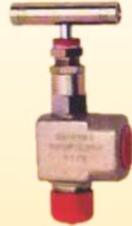
TNCNA/TNSNA Angle 90

WP: 6000/10,000 Size: 1/2" M*F Material: CS/316SS Multi-Port