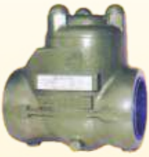
TKAD THD Swing Check

WP: Up to 2000, NACE Size: 1" through 4" DI *CF8* Viton*FP