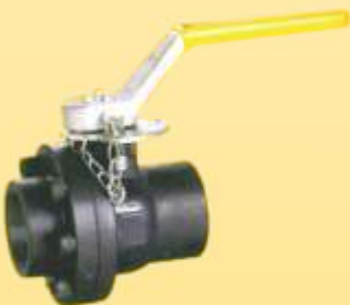
TBBC Bolted Ball Valve

WP: Up to 3600, NACE Size: 2-3/8", 2-7/8" WCB*SS*FP