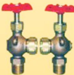
Water Gauge Valve

WP: 400 Size: 1/2"X5/8" Material: Bronze