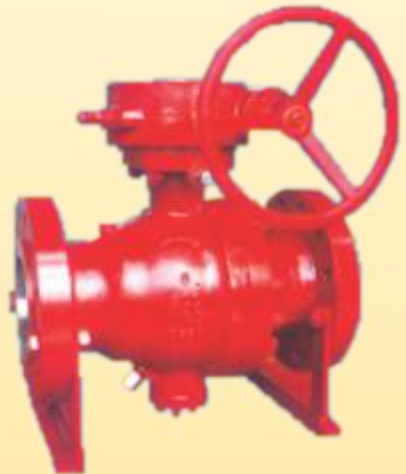
TFBT Trunnion Ball Valve

ANSI: 150, 300, 600, NACE Size: 4" through 12" WCB *SS*FP*W/Gear