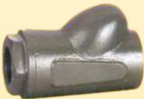
TKBD THD Ball - Check

WP: Up to 2000, NACE Size: 1" 2" long Pattern DI/WCB *CF8* Viton*FP