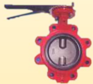
TWL Lug W/Short Neck

WP: 200 Size: 2" through 12" DI *NPDI/CF8M* Buna