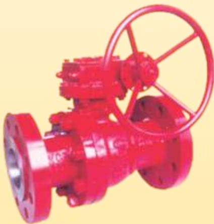
TFBF Floating Ball Valve

ANSI: 150, 300, 600, NACE Size: 1" through 4" WCB *SS*FP*Lever