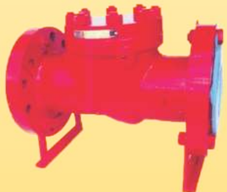
TFKA Flange Check Valve

ANSI: 150, 300, NACE Size: 2" through 6" WCB *SS*CF8M* Full Open