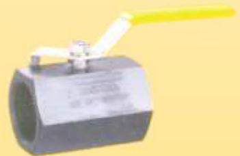
TBFC 1PC THD Ball Valve

WP: Up to 2000, NACE Size: 1/4" through 2" WCB*CF8*FP locking HDL