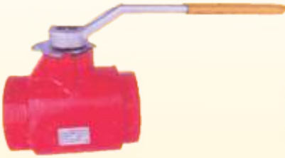
TBAC THD Ball Valve

WP: Up to 5000, NACE Size: 1" through 4" WCB*SS*Derlin*FP/RP