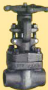
TSG Forged Gate

ANSI: 800, NACE Size: 3/8" through 2" A105*CR13 SS*RP