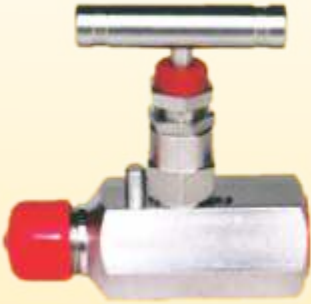
TNCNPV/TNSPV Needle Valve

WP: 6000/10,000 Size: 1/4" to 1", M*F, F*F Material: CS/316SS