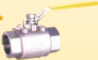
TBES 2PC THD Seal Welded

WP: 1000, NACE Size: 1/4" through 2" 1-PC, CF8M*CF8M*RP