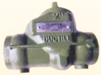
TKAD THD Swing Check

WP: Up to 5000, NACE Size: 1" 2" 3" WCB *CF8* Viton*FP